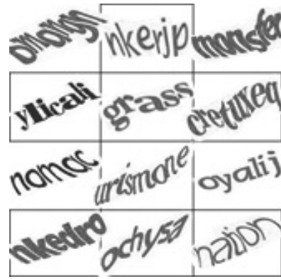
Figure 1: Example of a clickable CAPTCHA. The user’s task is to identify the three valid English words (in this example: monster , grass and nation ). In our experiment, the data entry was done using the cell phone keypad, and each of the grid element is mapped to one of the keys. Data entry may be somewhat faster for devices with touch screens.

We describe an embodiment of clickable CAPTCHAs based on Google textual CAPTCHAs [8]. We create 12 Google CAPTCHAs and tile them in a 3-by-4 grid. Of the 12 CAPTCHAs, 3 represent real English words (chosen at random from a dictionary of English words) whereas the remaining 9 do not correspond to any English word. The 3